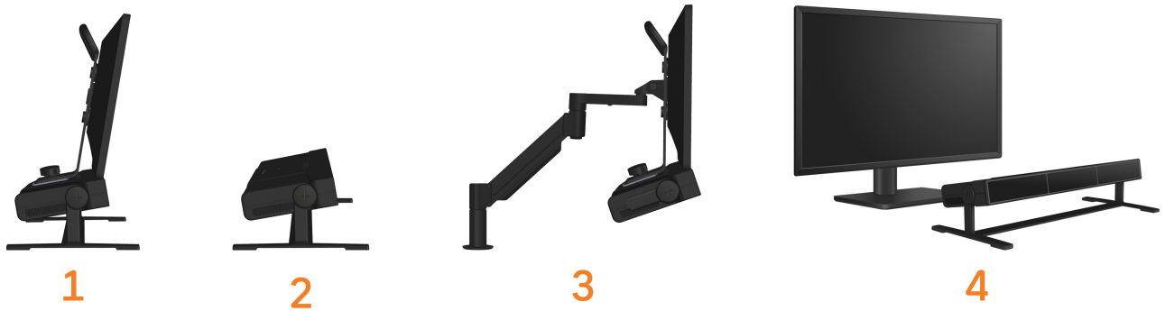
Figure 2. Display options for Pro Spectrum.